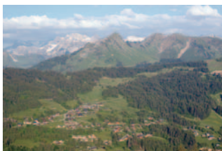
Les Gets (France)